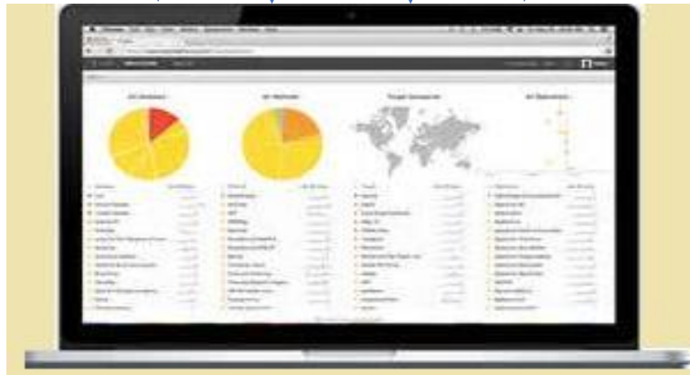
CENTRAL REPORTING DASHBOARD