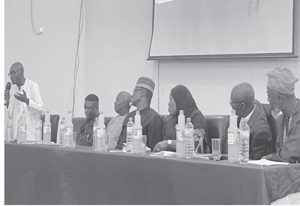
•Prince Kanmi in white speaking at the event

"You cannot bring sanity to a system unless you are ready to bring value to it and It is about value you have developed as you are growing up that will assist. Our limitation to development in Nigeria is because we have lost value, not corruption."