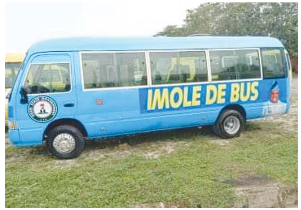
•The Imole bus

Scholar Bus and Adeleke of PDP refurbished those buses and revived the scheme. Simple as APC!