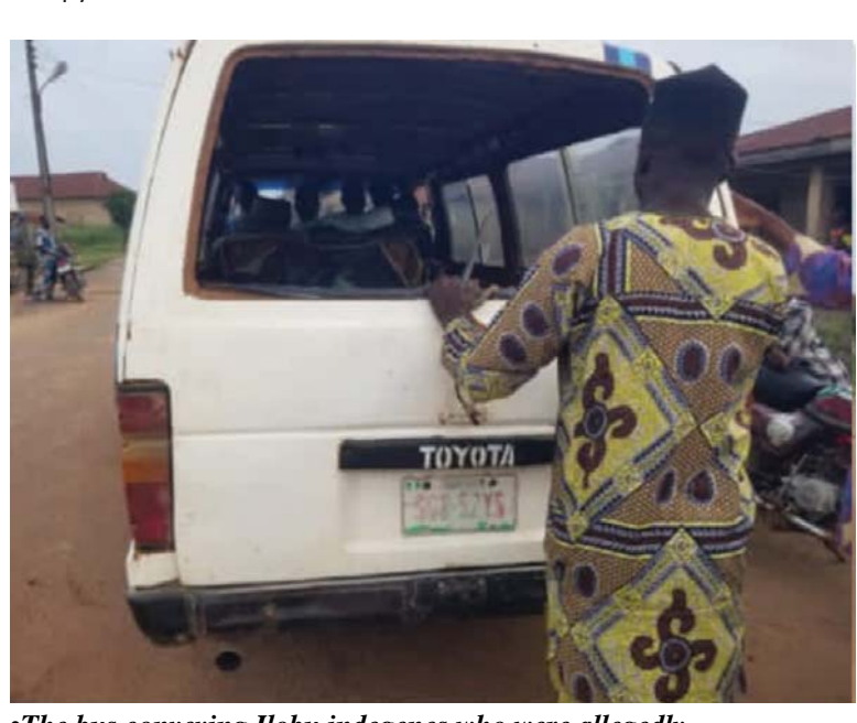
•The bus conveying Ilobu indegenes who were allegedly attacked by Ifon people